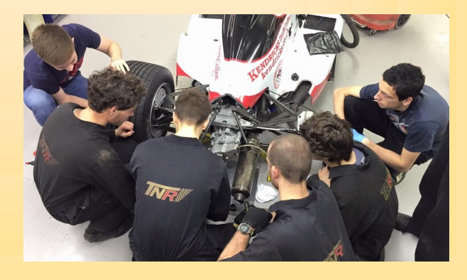
Northbrook College, STEM Winners 2015 & 2016