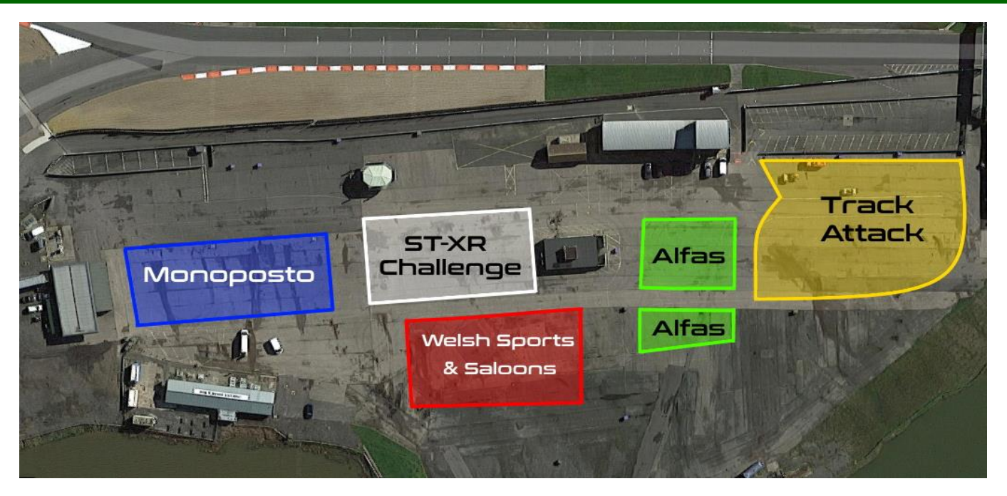
25 Circuit Map