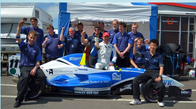
University of Wolverhampton, 2nd STEM 2015

If you're not an engineer and love motorsport, there are additional ways to get involved, contact us and find out how we can help you become a part of Motorsport.