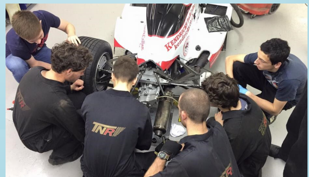
Northbrook College, STEM Winners 2015 & 2016