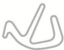
international gp 2.10 Miles