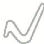
national 1.20 Miles